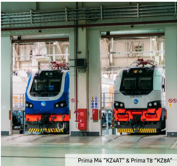
Prima M4 "KZ4AT" & Prima T8 "KZ8A"

Alstom is present in Kazakhstan since 2010 with more than 1000 employees and after 10 years of continuous development, it now has 7 sites throughout the country: two Joint Ventures: EKZ in Nur-Sultan for electric locomotives production and maintenance and KazElectroPrivod (KEP) in Almaty for the production of point machines; three service depots, one repairing center and one administrative office. Alstom is the only manufacturer of electric locomotives and point machines in the Central Asian and Caucasian region and a major contributor to the revitalisation of its rail industry and the development of its economy.